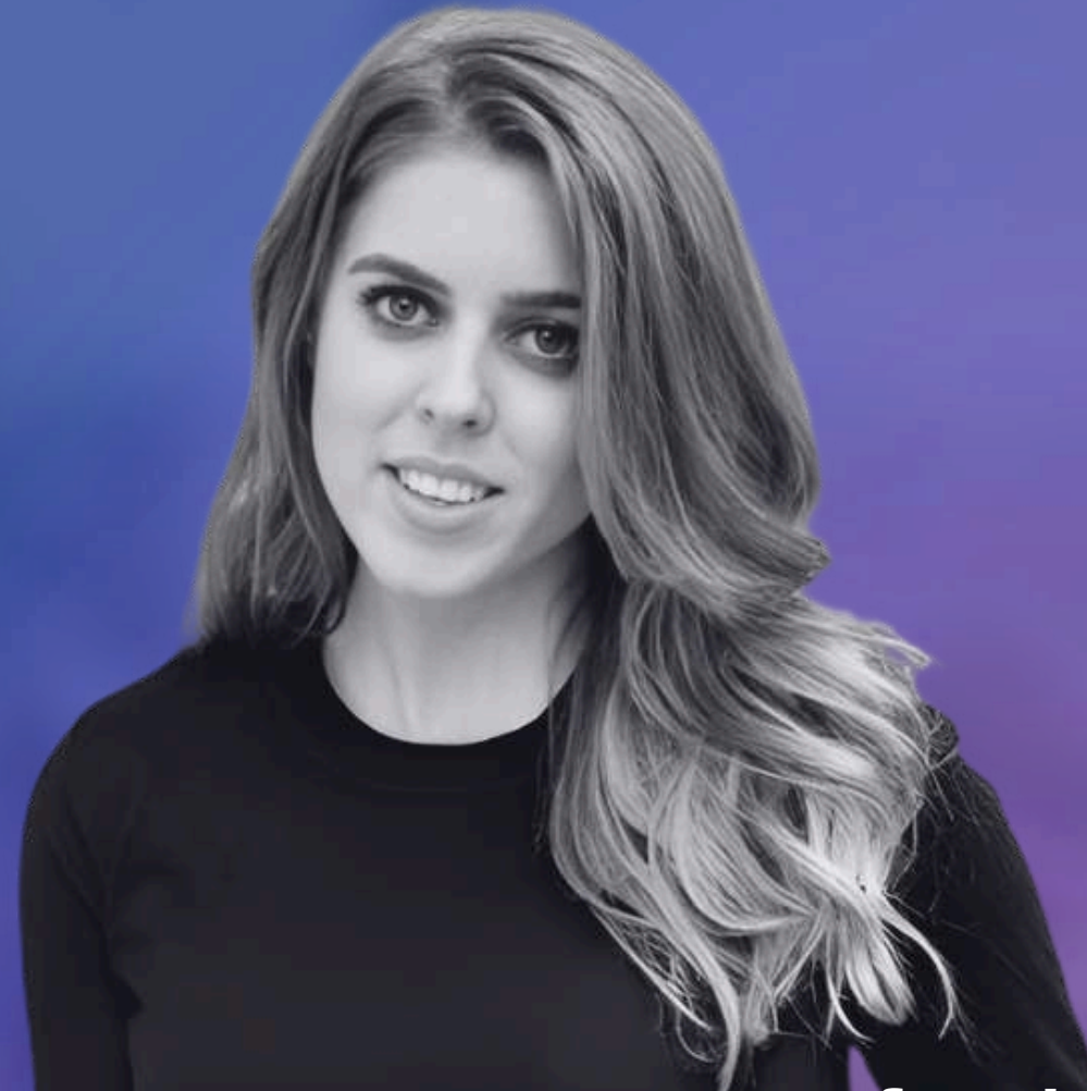
H.R.H Princess Beatrice of York