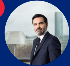
Laurent Saint-Martin CEO BUSINESS FRANCE