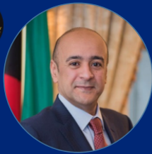
H.E Jasem Mohamed Albudaiwi Secretary General GULF COOPERATION COUNCIL (GCC)