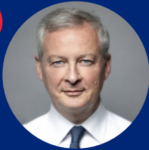
Bruno Le Maire Minister of Economy, Finance and Industrial and Digital Sovereignty