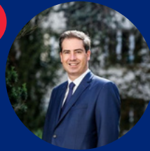
Olivier Becht Minister Delegate for Foreign Trade, Economic Attractiveness and Foreign Nationals Abroad