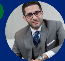
Faisal J. Abbas EDITOR-IN-CHIEF ARAB NEWS