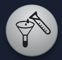
Medical & Laboratory Equipment